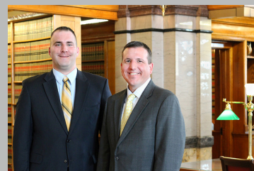
ISAC Government Relations Team

Vision principal, authoritative source of representation, information and services for and about county government in Iowa.